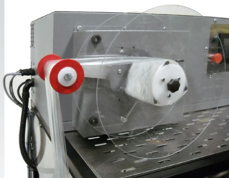
Easy Access Film Scrap Wind-up